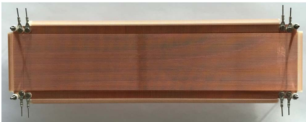
DLD40x200 delay-line anode with sideways terminals for very long rectangular MCP detectors. Anodes for any detection length between 40 and 210 mm can be provided on demand.

For applications where only one-dimensional position info is required the “short” dimension may be further reduced on demand, however, RoentDek recommends to optionally include the second delay-line for system verification and maintenance, even if only one dimension needs to be recorded for the specific experimental task.